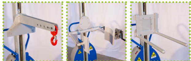
G - Crane Arm