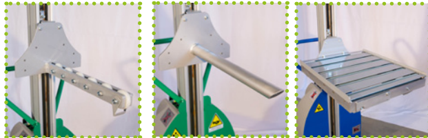
SR - Spur with rollers