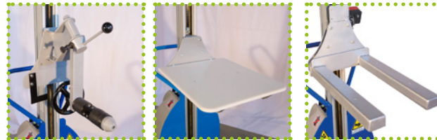
R - Roto-reel