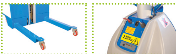
Detail of frontal swivel rollers (optional)