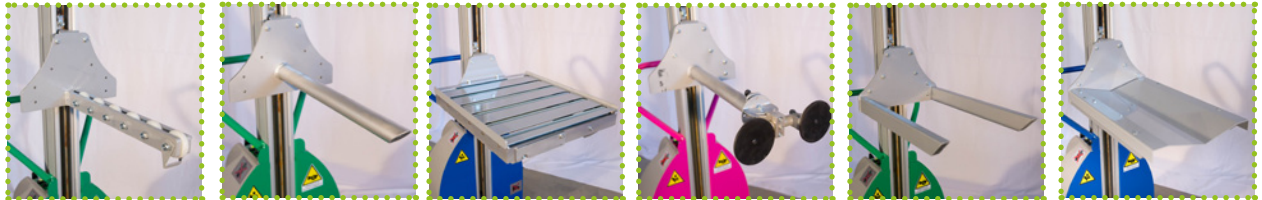
SR - Spur with rollers